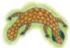
Port Lincoln Aboriginal Health Service

Look, Think, Act Participatory Action Research to improve diabetes self- management with Aboriginal families